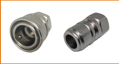
High pressure quick coupling