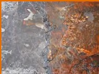
Surface ultra impact rotating