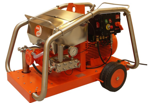
CEX 40 Series