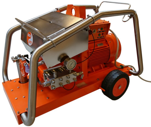
CE 40 Series