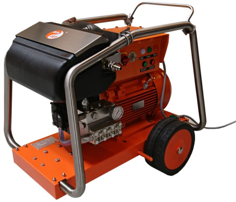
CE 20 Series