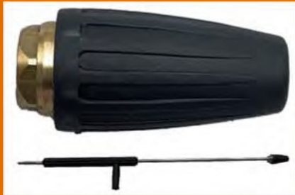
Single barrel lance with rotating nozzle