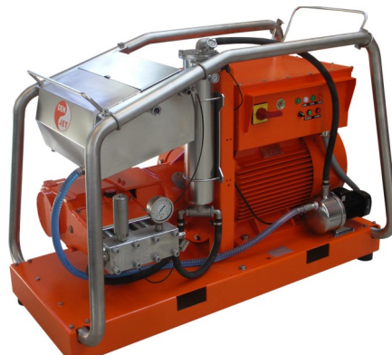
CE 100 Series