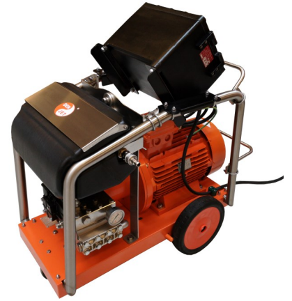
CEX 20 Series