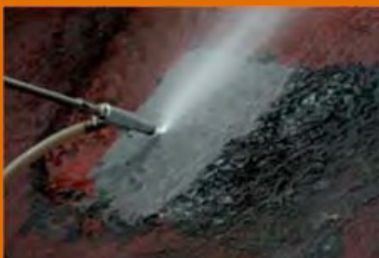
Surface sand blasting