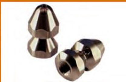
Drain cleaning nozzle