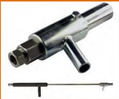
Single barrel lance with sand blasting kit c/w boron carbide nozzle