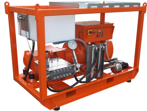
CE 150 Series