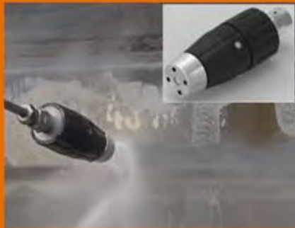
Ultra impact rotating nozzle